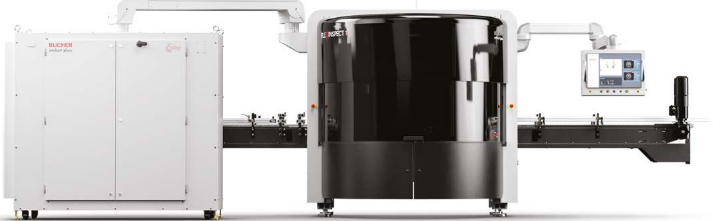
FleXinspect T with ID Read.