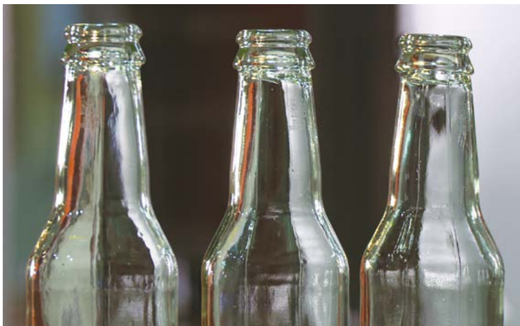
Scout interface w/a DMX code, as read by the ID Read.

Having the ability to control and measure all aspects from the forming process and validate the results within the inspection area is what separates Bucher Emhart Glass from the rest of the industry. ●